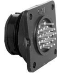
P/C Tail Panel Mount 14XXX-XXXG-XXX Matching Mates: • Cable Pin 13X8X-XXPG-XXX • Cable Socket 13X8X-XXSG-XXX